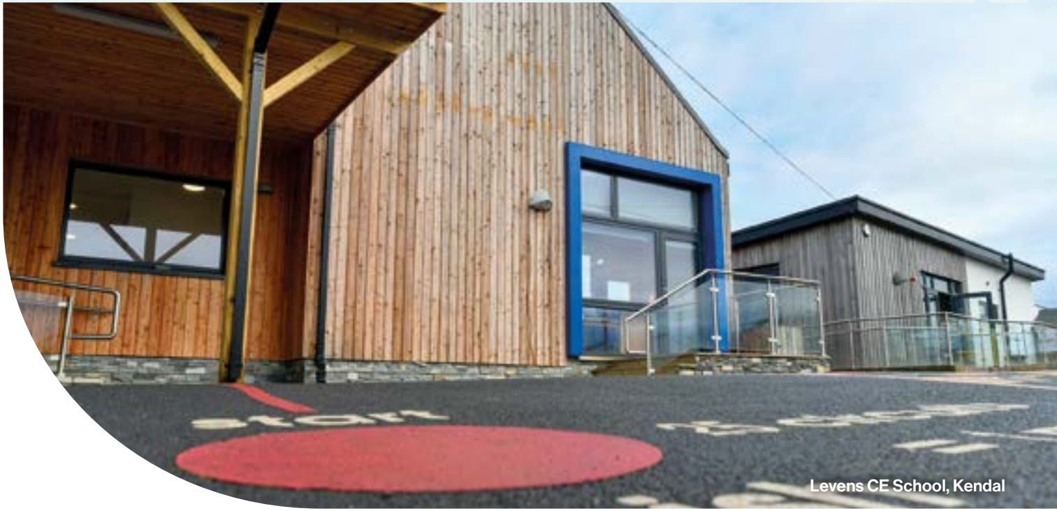
Levens CE School, Kendal